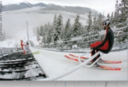
Awaiting the jump signal