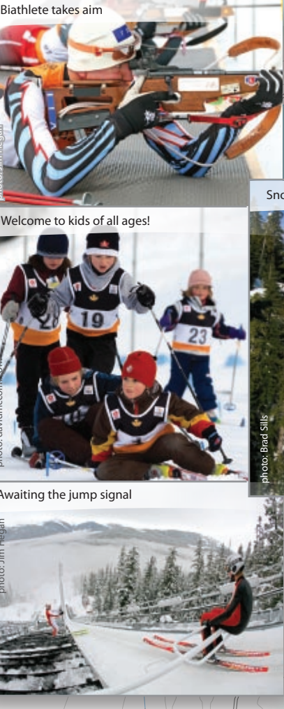
Biathlete takes aim