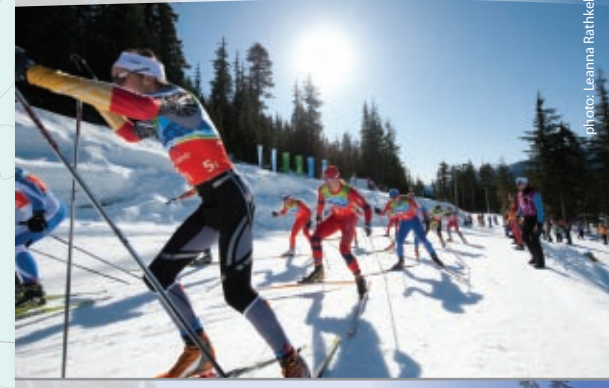
Whistler Olympic Park Day Lodge