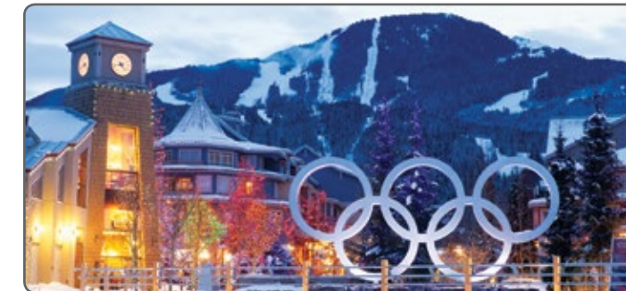
WHISTLER OLYMPIC PLAZA